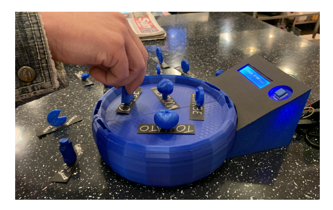
Figure 3: Participant placing 3D printed ingredients onto the base of the PizzaBox before pressing the order button.

Prototyping PizzaBox: As detailed in [3], the hardware that we have chosen to use in this project attempts to remain true to the low-cost ethos. Arduino Uno, and LCD screen, SparkFun Simultaneous RFID Tag Reader, and RFID tages were used to build the prototype.