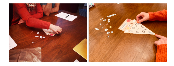
Figure 1: Participants engaging with a prototype in round one. Use of the prototype was unguided to understand how intuitive and easy to use the prototype was.

For each group, we first explained in detail what our project entailed and then asked them to work together and sketch out their own idea for a prototype to fulfil the goal of our project. The idea behind this was to find common elements that each of the groups came up with and whether those common elements appeared in our own prototypes or the opposite if they didn't appear in our prototypes then we could consider a possible design change. Each group received a questionnaire to fill in and forms for leaving feedback on each of the prototypes that they will be shown.